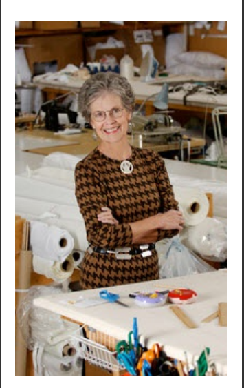
Click here to read past newsletters!